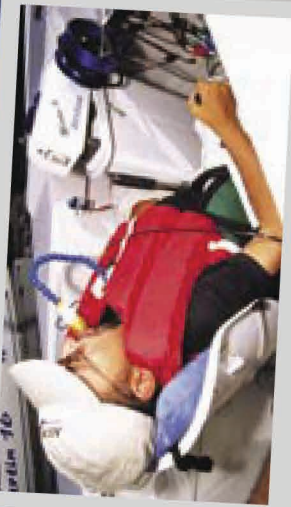
Some of the sailors use the Martin 16 Autohelm/Windlass system. They sheet the sails and steer the boat with their breath!